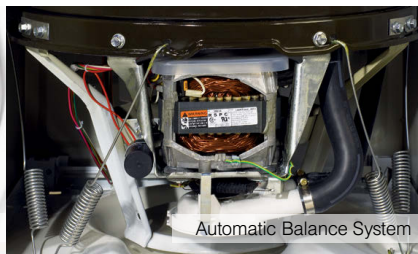
Automatic Balance System