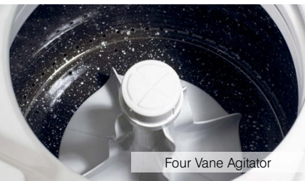
Four Vane Agitator

Laundry owners can pre-program Econ-O-Wash top-load washers for extended cycle times and waterfall fill for enhanced wash/rinse quality. Additionally, the machines offer two agitation and spin speeds for the ultimate in washing capability.