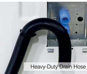
Heavy-Duty Drain Hose